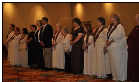
New Rebekah Assembly Officers waiting to be installed