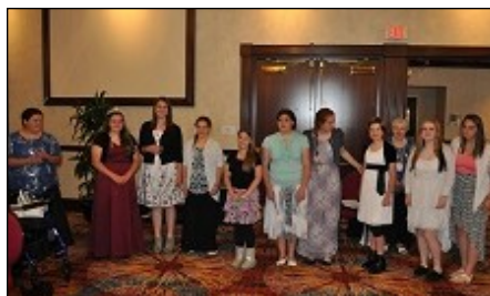
A leader is one who knows the way, goes the way, and shows the way. ~ John C. Maxwell