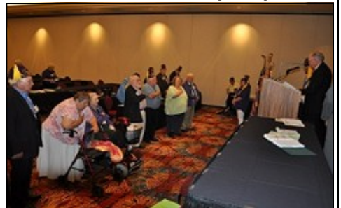
Members receiving the Encampment Degree