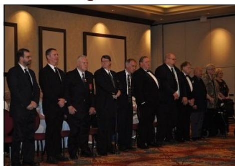
New Odd Fellow Officers waiting to be installed