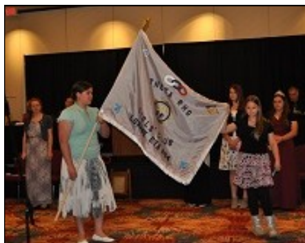
above & below Lorane Eta Theta Rho