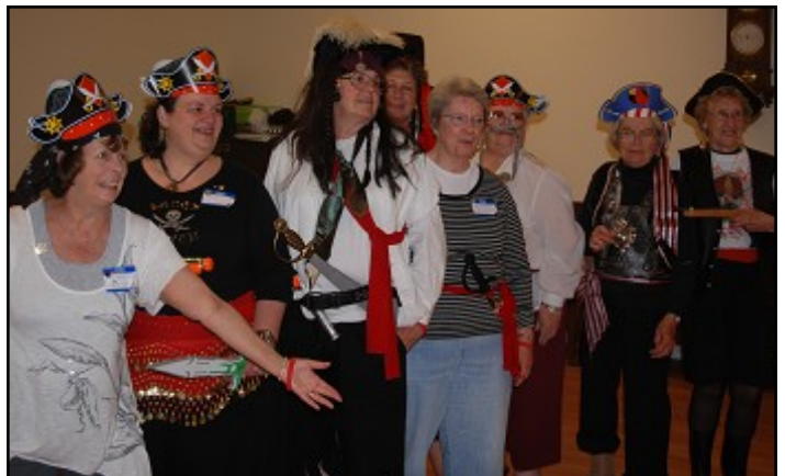
Pirate Ship Crew