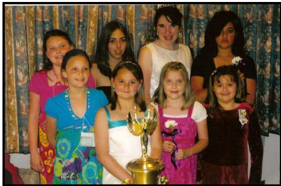
Eta # 94 with Club Community Service Trophy