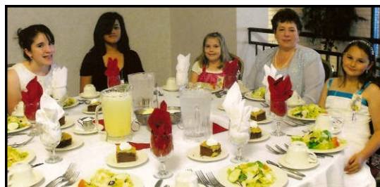
Sitting pretty at the Thet Rho Banquet